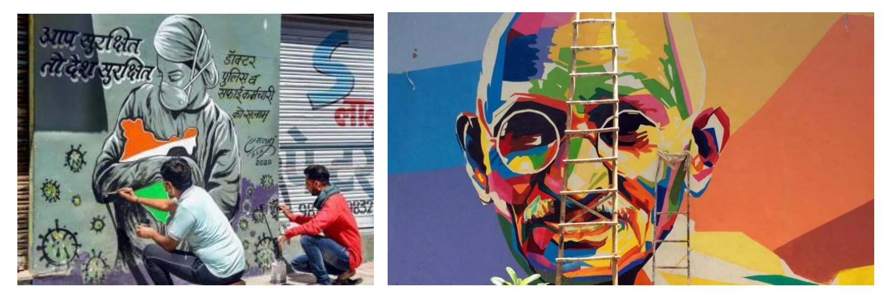
Developed India Graffiti

* Detailed guidelines and submission process will soon be available on the designated QCI portal. The link will be shared with you in due course of time.